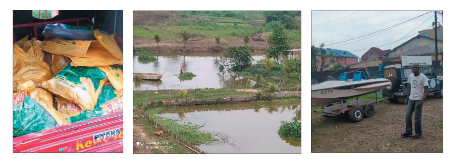
Dried fish is transported in 50 kg packages. A friend donated a boat for the fish pond project.

of the fish pond got washed away and many of the fish were swept away. Unfortunately, there was also a wide spread swine disease in the region and some of his pigs died as well.