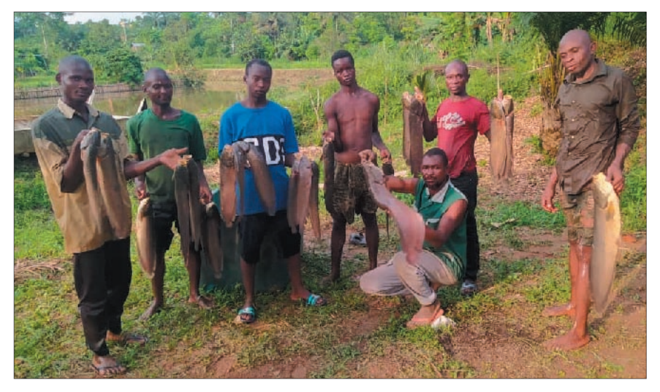
Some of the big fish from Joseph's fishponds