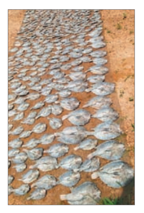
For preservation, the fish are salted and dried

coconut trees even if it will take time for them to bear fruit.