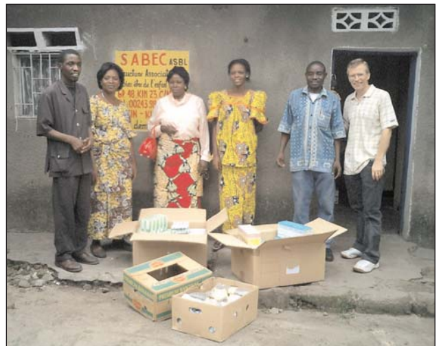
Seeds for the field, medicine against malaria & fever