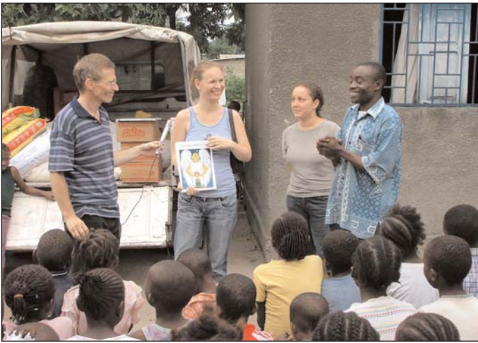
Presenting food and educational materials to the orphans