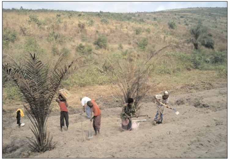
Clearing of the rough terrain, getting ready for the planting