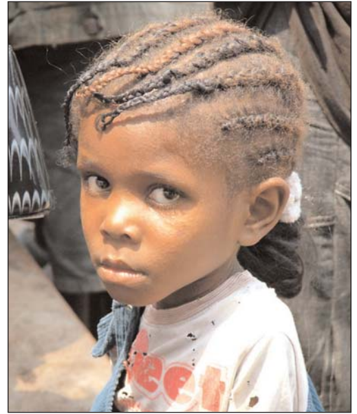
Reddish-brown hair, a sign of malnutrition