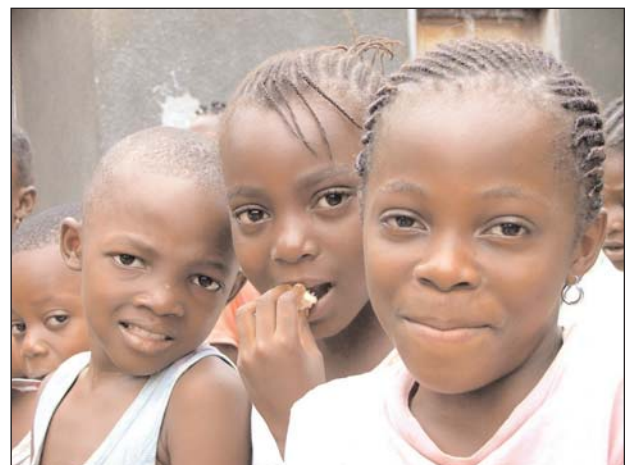
The first step was to give them some food for their immediate need. The agricultural project is to build their future.