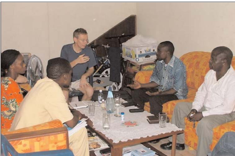
Planning the future of the orphans with members of SABEC