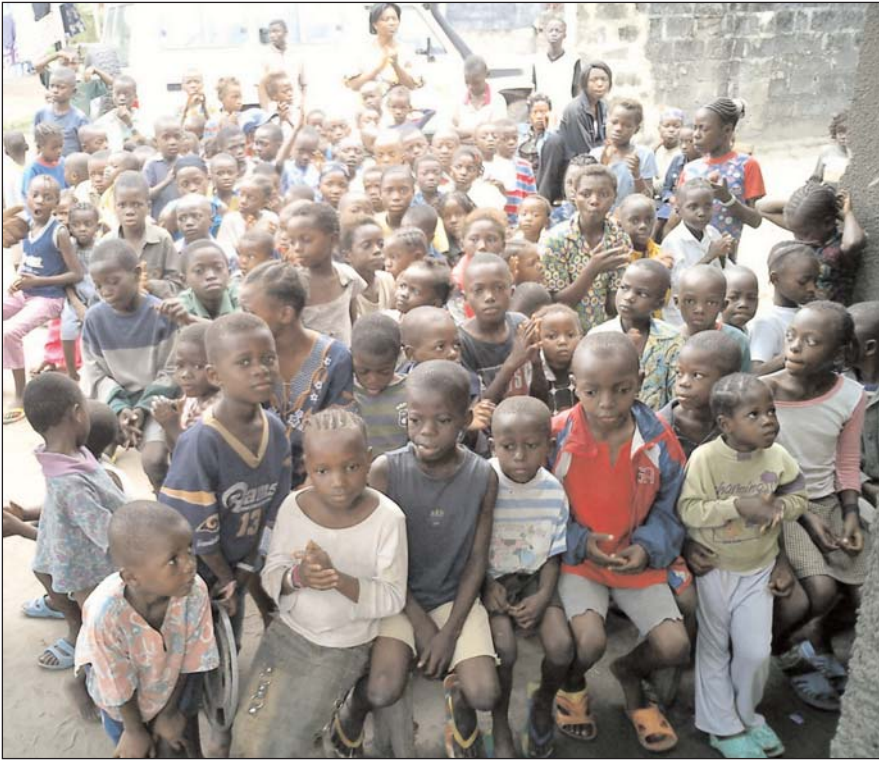
98 orphans are left at the SABEC Center. Let's give them a better future!

subjects yourself please let us know and we will do our best to supply you with the needed materials.