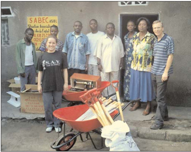
Two sewing machines and different tools for the field