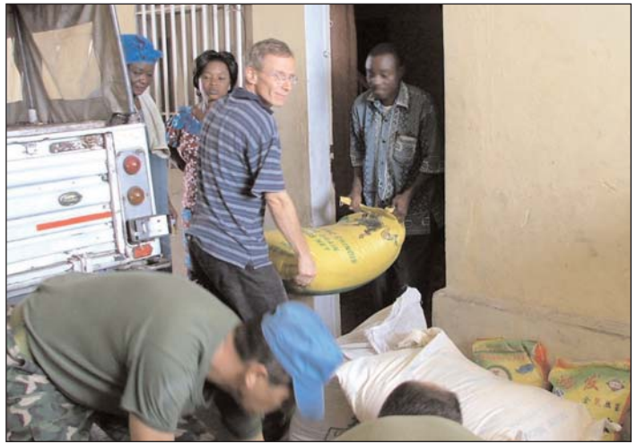
Bringing 500 kg of rice, flour, beans etc to a safe storage

earn a little money and teach the older kids to sew.