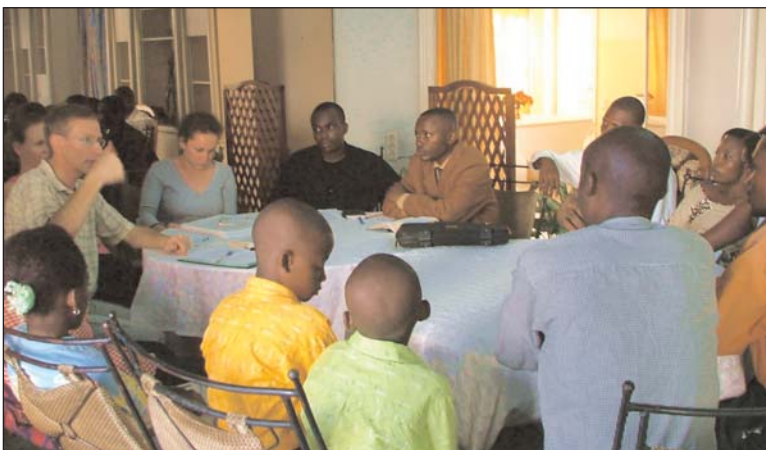
One of our Sunday Bible Studies - the "12 Foundation Stones"

In order to reach that goal we distribute tracts with this message of God's love, sharing and peace. We are also distributing the "Activated" magazine by mail, e-mail and printed copies as well as other very helpful educational and spiritually uplifting materials. And for those who want to deepen their personal relationship with God, which a lot of people in the Congo want to do, we offer a weekly special Bible Study course called "12 Foundation Stones". These cover important subjects like Eternal Salvation, the Word of God, Prayer, Hearing from Heaven, the End-Time and Jesus' Return etc. If you are interested in any of these