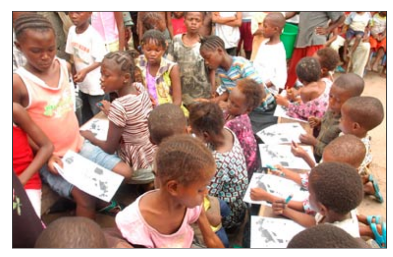
Orphans coloring in pictures, most of them for the first time