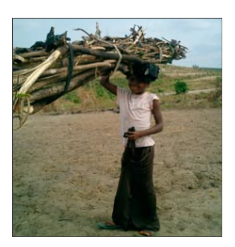
Orphan brings wood to the market