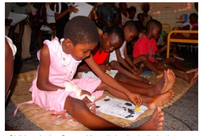
Children in the General hospital color in their pictures...