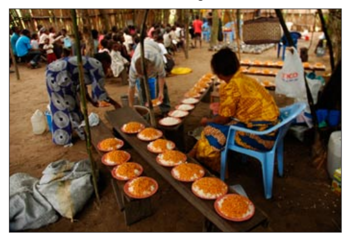
Hot off the griddle: it really tastes yummy...