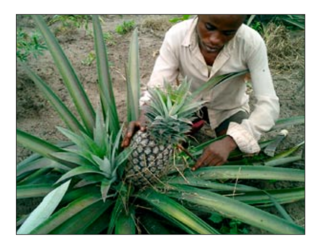
Papaya tree from our garden at the field. First pineapples after almost 2 years

Bank account: Aktive Direkt Hilfe e.V., Postbank Dortmund, number 298 000 461, BLZ 440 100 46, IBAN: DE 92 4401 0046 0298 0004 61, BIC: PBNKDEFF