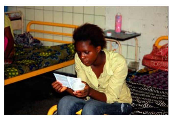
...while the older ones study with interest their tract