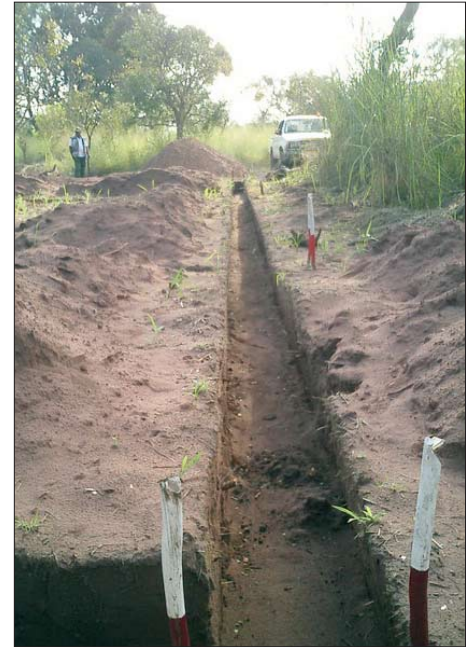
Foundation ditches for the school

Before we could go to Mushapo to start with the construction, we met old and new friends in Kinshasa who are very excited about our project and wish to help us. For example, CAA, the biggest airline flying from Kinshasa to Tshikapa, the main city near our project, wants to regularly sponsor our tickets, which is a