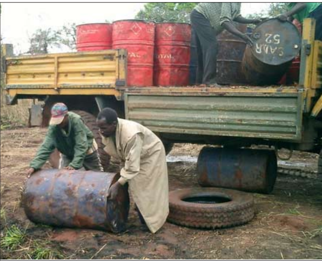
Twenty 200 liter water barrels at the construction site