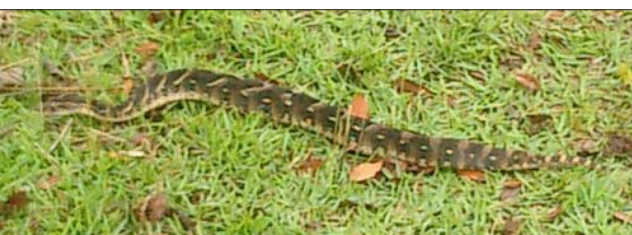
This viper was outside our kitchen, soon to be eaten by hungry people. They consider it a delicacy!