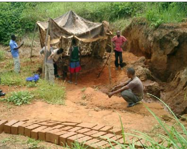
More bricks are being pressed, dried and baked.