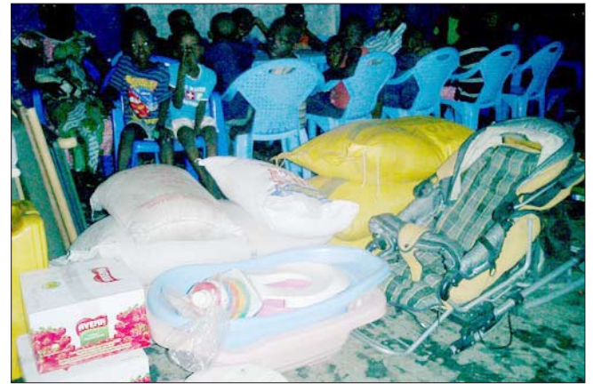
Distribution of free educational materials to schools and orphanages in Kinshasa. Food and other aid for the orphans.

tremendous help towards our work. The Vodacom foundation wants to donate school benches and desks. Other people gave generous donations and offered to seek more support for our project. Thank you so much for all your help!