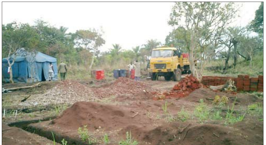
Construction site: tent for the guards, water barrels, bricks, sand and gravel