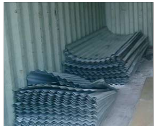
Wooden planks & beams for the roof, doors etc. Iron for the foundation & pillars. Corrugated metal sheets for the roof.