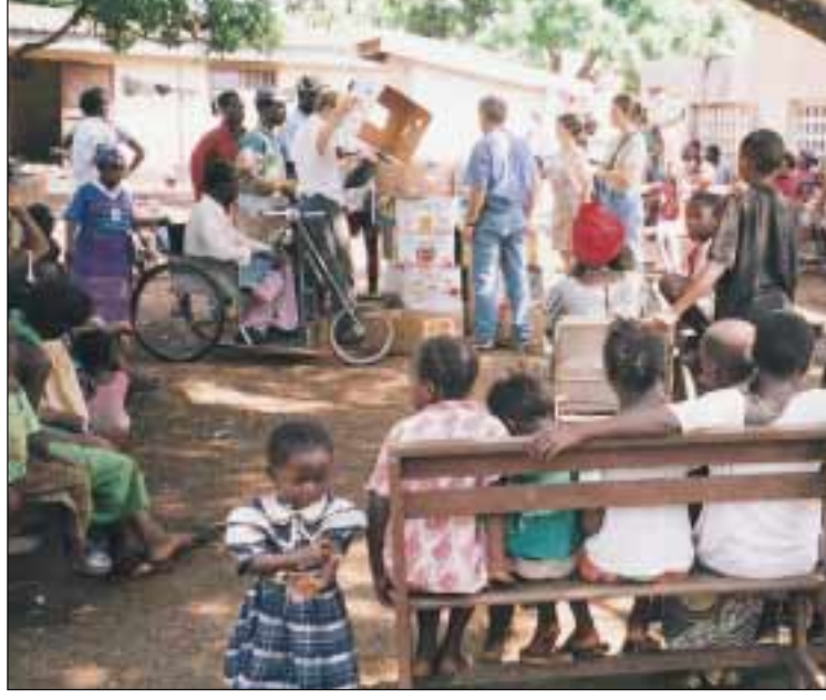
Blind and handicapped persons with their families in "Cité de Solidarité".

We started the first distribution in Conakry two days later in the "Cite de Solidarite", where 55 handicapped (blind, cripples etc.) and their families live together. They beg daily on the streets for a living since there is no such thing as welfare. They were so happy and thankful for our visit and gifts.