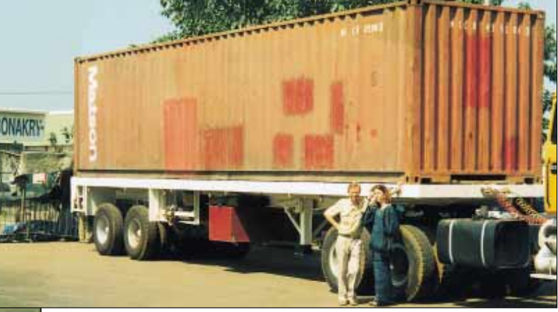
Our Container outside the port of Conakry.