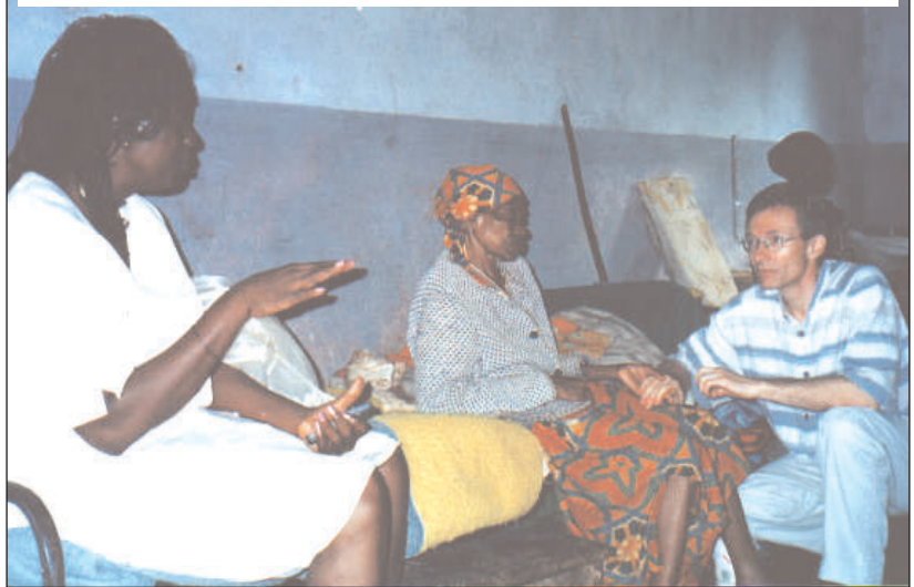
At an old-folks-home with the Minister of Social Affaires

the Love of God and His tender care for them even if they would fall at times. We also told them about His personal involvement in each of their lives and to what length He goes to to take care of and understand them. "He's touched with the feeling of our infirmities" (Hebr. 4:15). They definitely seemed encouraged after we finished, and begged us to come again."